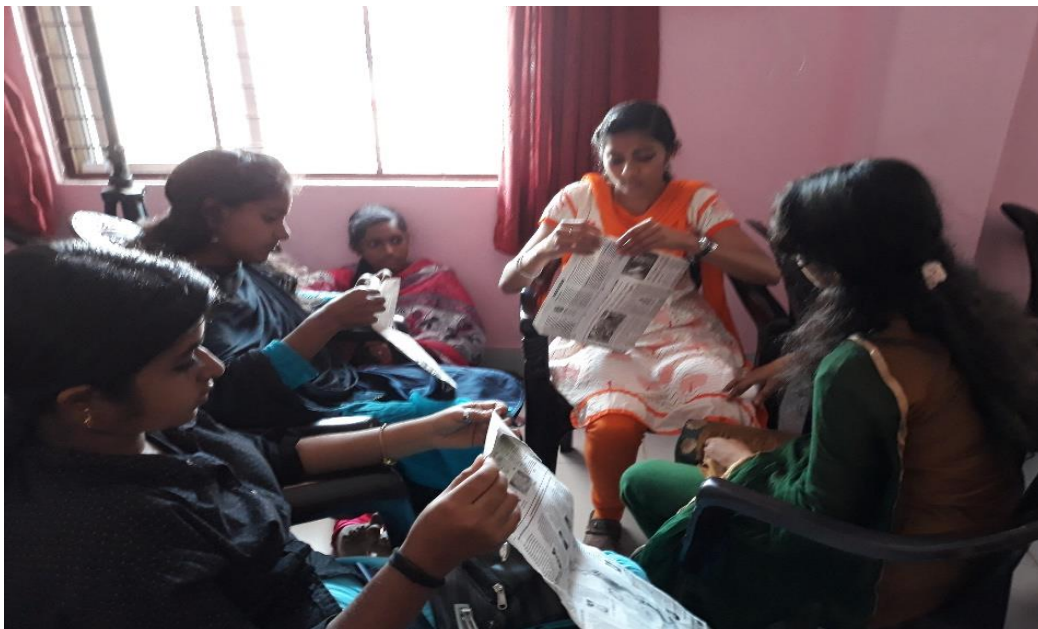
PAPER BAG MAKING WORKSHOP TO ELIMINATE PLASTIC CARRY BAGS FROM PANCHAYATH