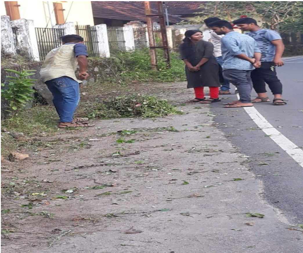
After flood cleaning program