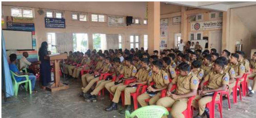
Anti drug awareness SN school Ala chengannut