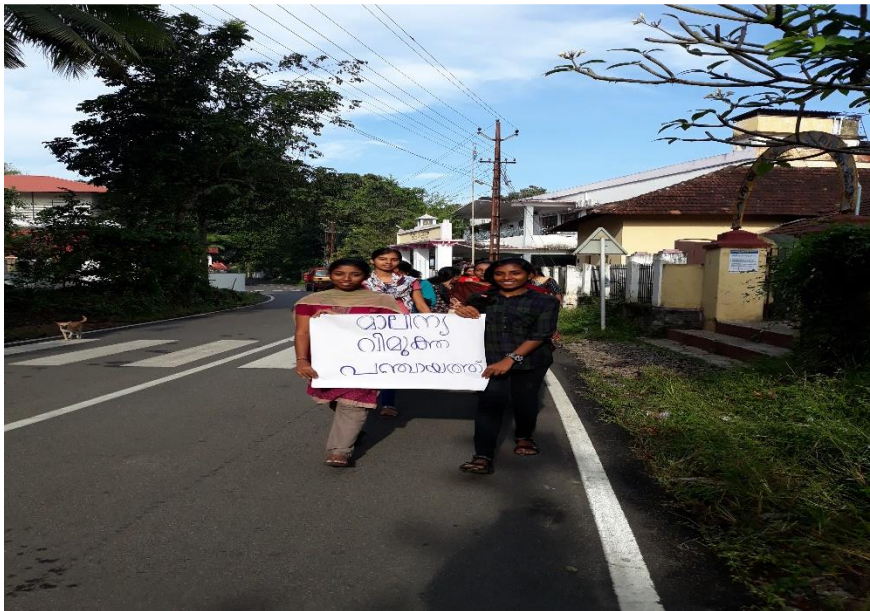
WASTE FREE VILLAGE CAMPAIGN