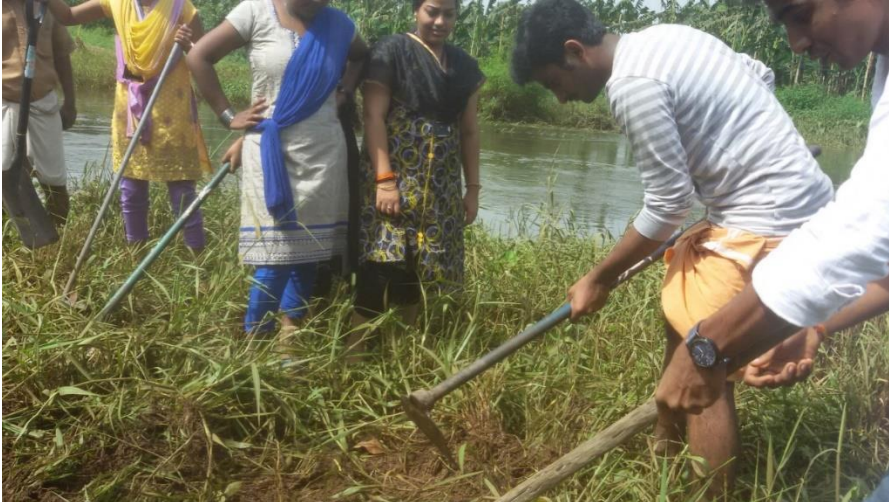
VARATAR REJUVATION AT THIRUVANVANDOOR PANCHAYATH PHASE 1