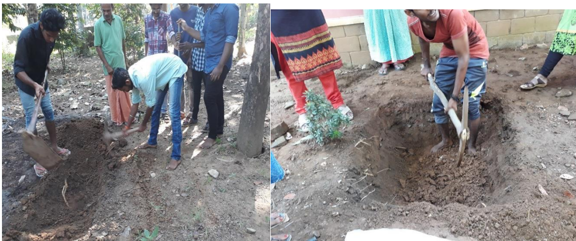
WATER RECHARGING PIT MAKING @VILLAGES