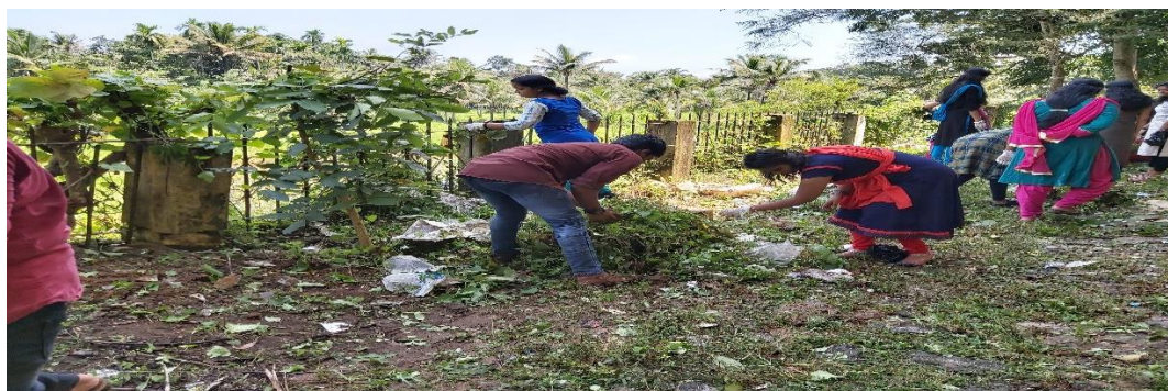
CLEANING MISSION AT WARD I THIRUVANVANDDOR