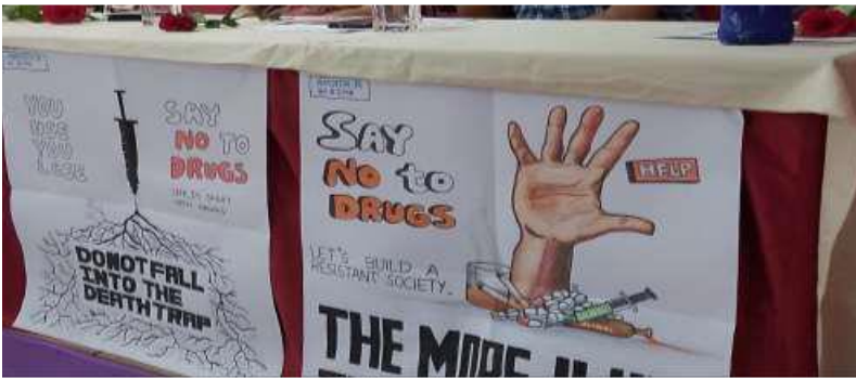
Antidrug poster making