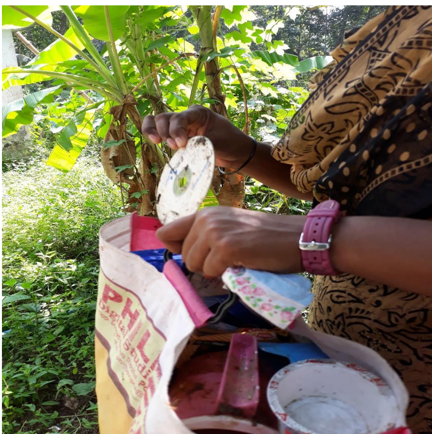
E- WASTE COLLECTION FROM ADOPTED VILLAGES