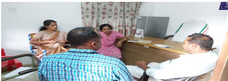
PANCHAYATH LEVEL DISUSSION AT THIRUVANVANDDOR VILLAGE