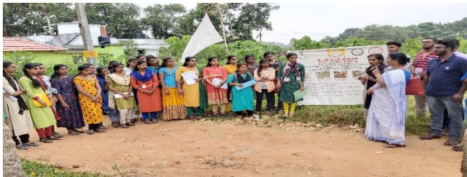
HOME LEVEL BASELEINE SURVEY AND VILLAGE SURVEY AT ,MULAKKUZHA