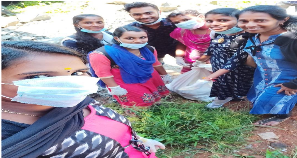
CLEANING MISSION BY PLASTIC WASTE COLLECTION FROM AT RIVER BASIN ALAPPUZHA