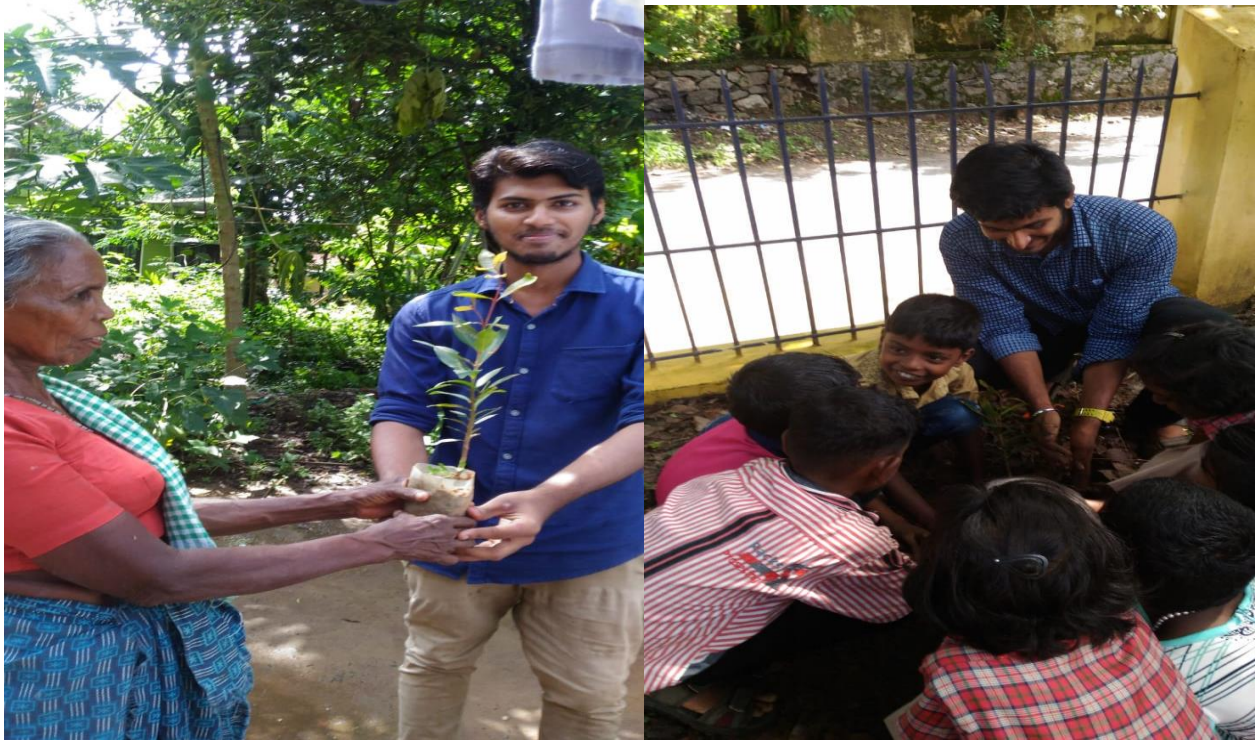
PLANTING TREES AT PANCHAYTH-