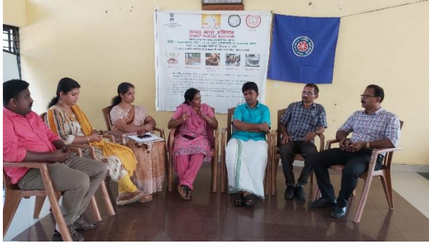
VILLAGE EXTENSION AT CHENGANNUR MUCIPALITY WITH MUNICIPAL CHAIRMAN AND WARD MEMEBRS