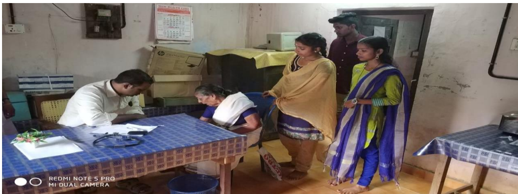
MEDICAL CAMP CONDUCTED IN ASSOCIATION WITH PHC