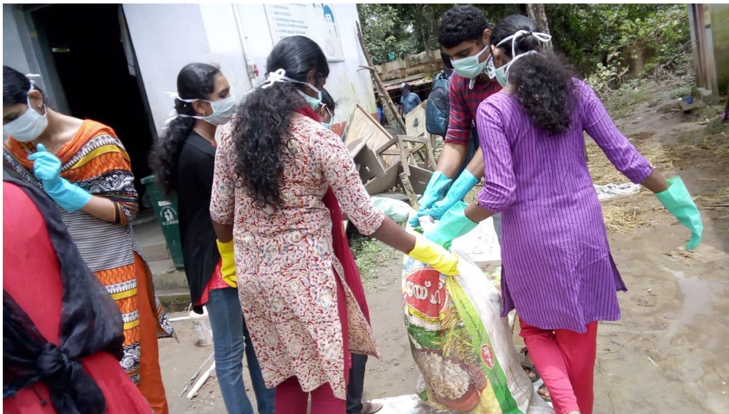
AFTER FLOOD CLEANING MISSION AT PANDANAD CHEGNAUR AND EDATHUA