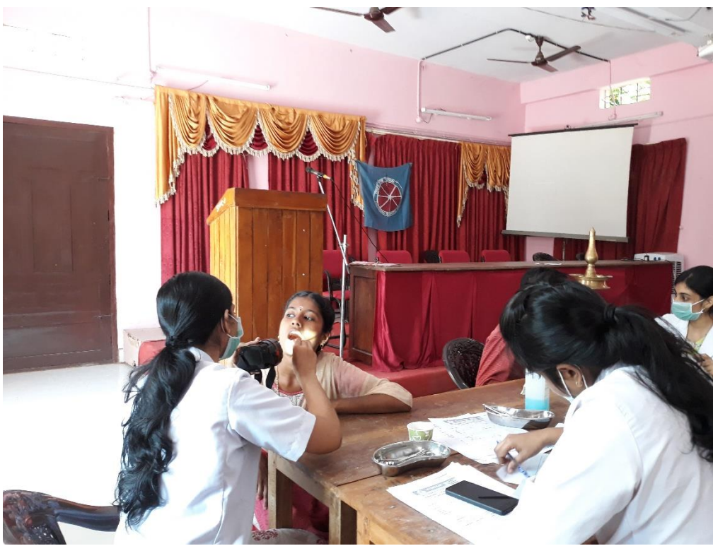
DENTAL MEDICAL CAMP CONDUCTED