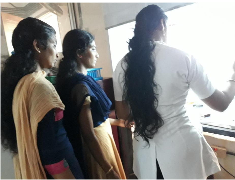
WATER QUALITY ANALYSIS FROM WELL WATER OF PANCHAYATH