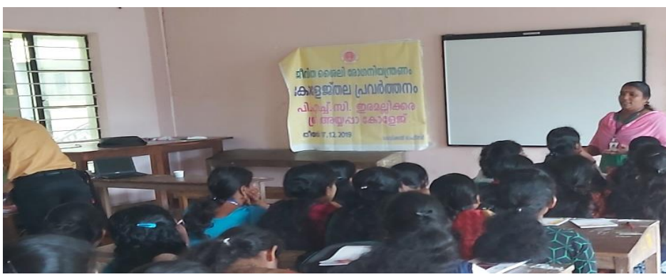
TRAINING ON PALLIATIVE CARE FOR YOUNG UBA VOLUNTEERS ALONG WITH NSS