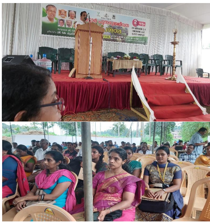
VARATAR REJUVANATION @ SECOND PHASE THIRUVANDOOR VILLAGE