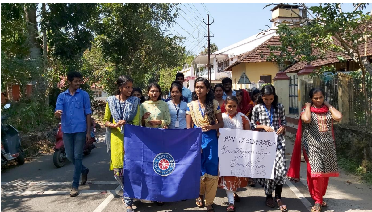
Blood donation camp in association with Pushpagiri Medical college Thiruvalla was conducted.