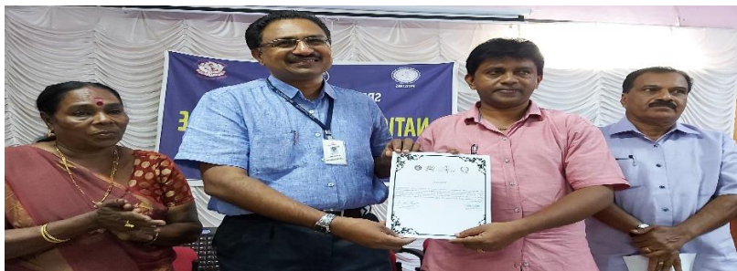
SIGNING OF MEMORANDUM OF UNDERSTANDING TO IMPLEMENT GO GREEN BAGS THIRUVANDOOR PANCHAYATH ANJOINT VENTURE WITH UBA SAC AND CHENGANNUR MUNICIPALITY .