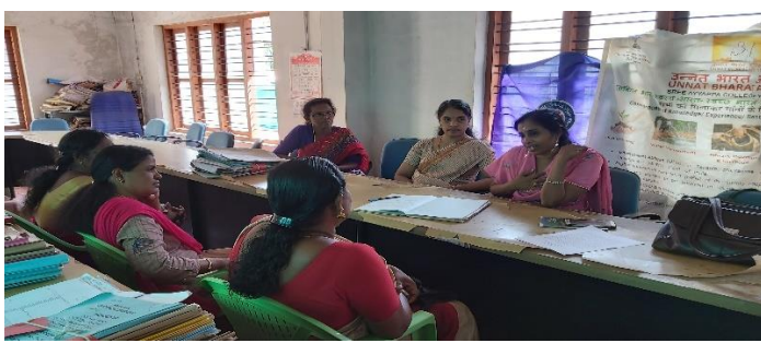
VILLAGE EXTENSION PROGRAM DISCUSION AT MULAKKUZHA VILLAGE WITH WARD MEMEBRS